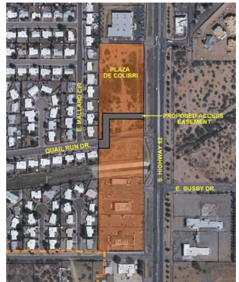
EXHIBIT A-EASEMENT AREA

Subsequent to the recording of Resolution 2013-118, the access to State Route 92 was relocated 11-feet to the north per the Arizona Department of Transportation (ADOT). The City Council reviewed and approved the relocated access as part of their approval of the Plaza De Colibri amended plat on December 14, 2017. The revised legal description for the easements reflect this relocation. The developer of the subdivision will pay for all associated costs.